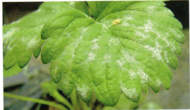
An infected leaf shows the devastating impact of Strawberry Powdery Mildew on plant performance.